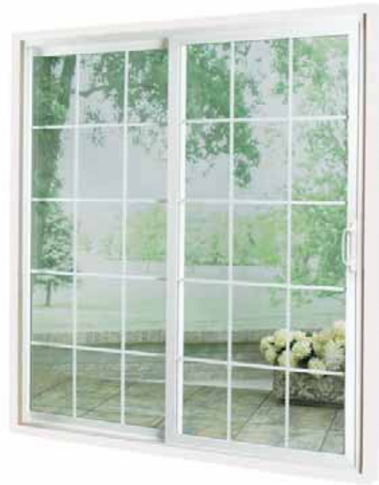
Patio door is available in White and Desert Sand.